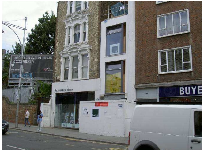
When there is a will there is a way; Notting Hill Prep. School entrance squeezed in between two existing buildings.