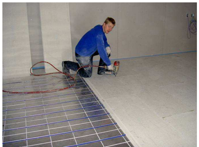
Fermacell flooring elements being installed using glue and diverging staples.